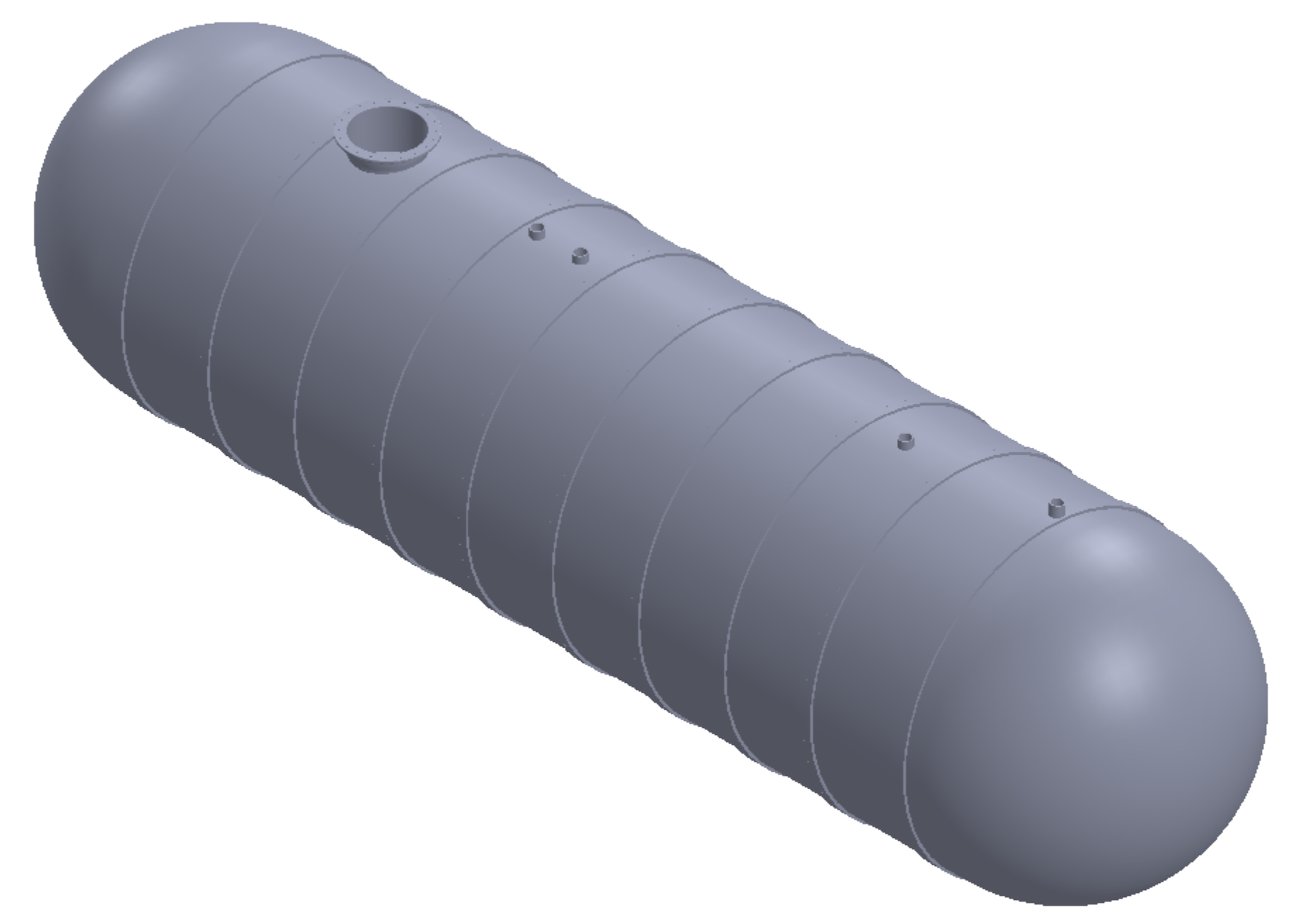
FTFNTD1037201 FT - FUEL 10' X 20K (2) 5 RIB SHELLS